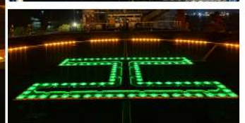
Classic NetLight System