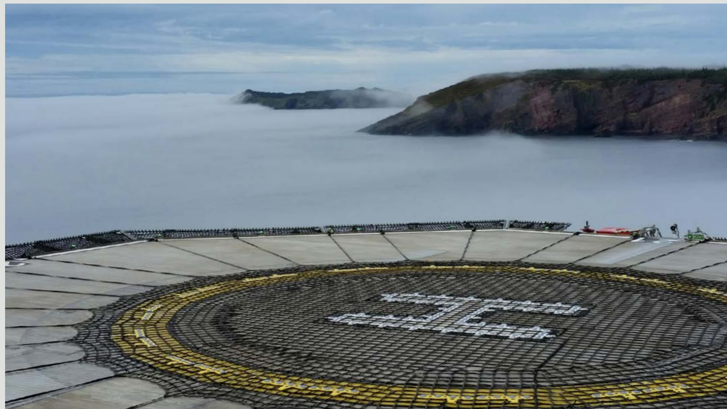
Frictape Classic Netlight

Frictape Circle & H Netlight is a groundbreaking solution, born from the requests of our customers for a more simple and low cost Circle & H lighting solution. Our innovative, standard-complying approach offers operational flexibility beyond any other system on the market: light modules can be integrated to the landing net (no need to drill holes to the helideck) or fastened to the deck in a more traditional fashion.