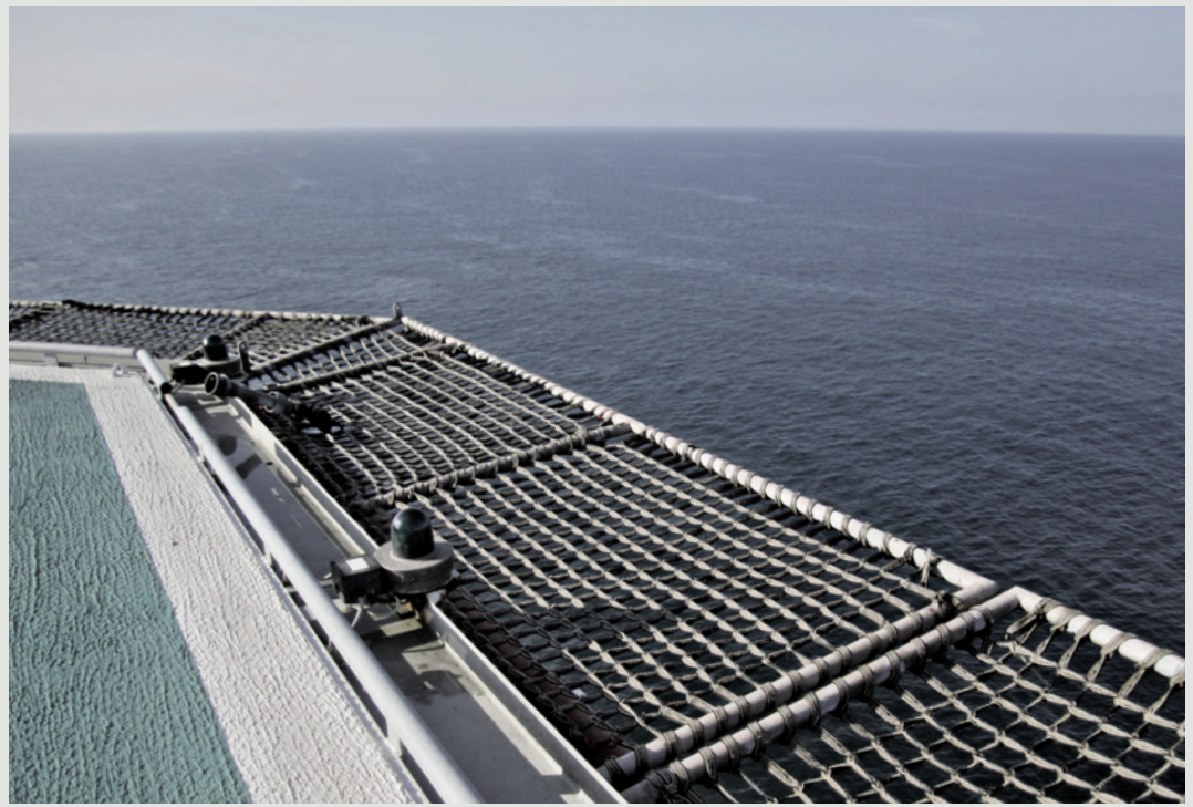
Frictape Perimeter Ne